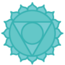
Vishuddhi THROAT CHAKRA

I EXPRESS WISDOM AND MAKE THE RIGHT CHOICES