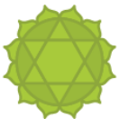
Anahata HEART CHAKRA

I EXPRESS WISDOM AND MAKE THE RIGHT CHOICES